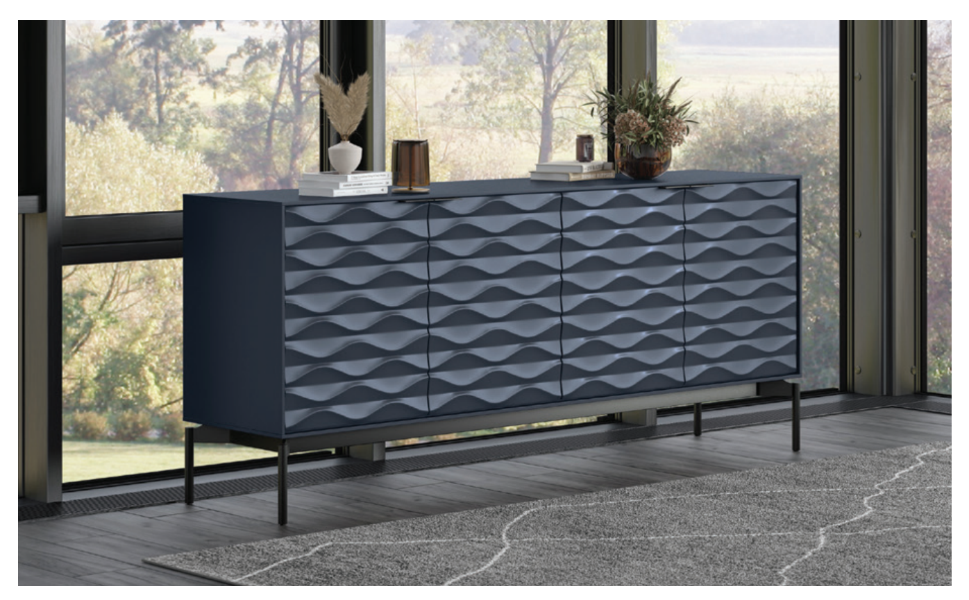
Ocean with Brushed Carbon legs