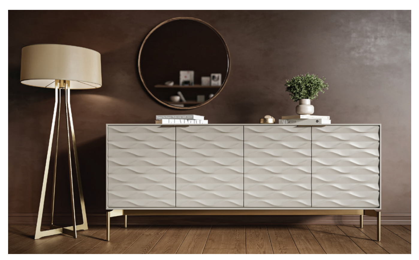
Stone with Brushed Brass legs