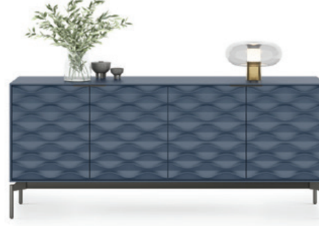
OCEAN & BRUSHED CARBON

Ripple cabinets are available in two finishes— Stone and Ocean—and two base options— Brushed Brass and Brushed Carbon.