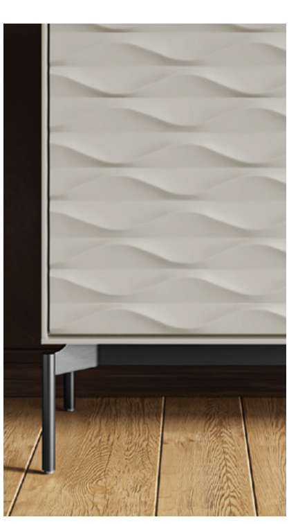
STONE & BRUSHED CARBON