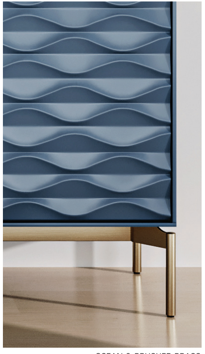
OCEAN & BRUSHED BRASS

Ripple cabinets are available in two finishes— Stone and Ocean—and two base options— Brushed Brass and Brushed Carbon.